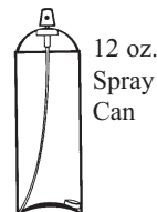
12 oz. Spray Can

Our Satin Black Enamel contains the correct blend of dulling agents to give that "Authentic New Look". Use it on inner fender wells, under hood, radiator supports brackets, fan, air cleaner, etc. It is also correct for chassis.