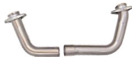
Crossover Pipe Only

Don't need the full set listed above?? This is stock crossover pipe only EP867T .....$175.00 Each