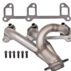
Drivers Side Only

Don't need the full set listed above?? This is the left side header only EH867TL .....$325.00 Each